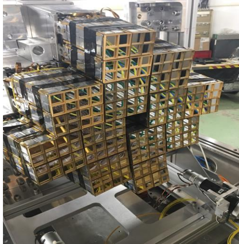
Figure 1: The FAZIA twelve blocks forward configuration for the INDRA-FAZIA coupling at GANIL.

The INDRA-FAZIA coupling at GANIL is constituted by the standard INDRA set-up except the five first rings (polar angle from 2^\circ - 14^\circ ) replaced by twelve FAZIA blocks in a “wall” forward configuration see figure 1 below.